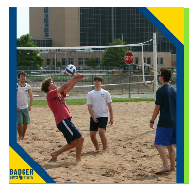
Badger Boys State - a new grantee of the Foundation - received a grant to send 3 Dunn County students to a week-long youth leadership program.