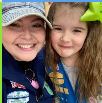
Our August grant cycle assisted the Girl Scouts of the NW Great Lakes with Volunteer Training Opportunities!