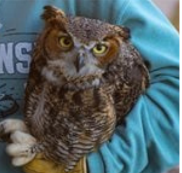
A grant provided enough funding for Colfax Wildlife Rehabilitation & Release to construct a new 50-foot flight enclosure for raptors.