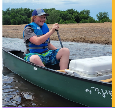
We helped replace worn canoes for Bulldog Adventures, an outdoor summer group for Boyceville middle schoolers.

The Foundation is honored to connect people who care with causes that matter. In 2022, we distributed grants and scholarships that greatly impacted our community in many ways, which could not have been possible without our generous fund holders. Thank you for helping make Dunn County a better place to live, work and play!