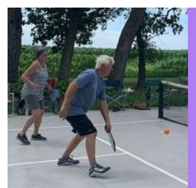
Pickleball fanatics rejoice! Courts are now available at Offutt Park in Rock Falls, WI. Our grant made this possible.