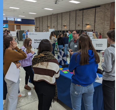
Junior Achievement of Wisconsin received a grant to help with important programming for middle and high schoolers.