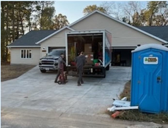
Habitat for Humanity works on finishing touches on Menomonie twin homes.