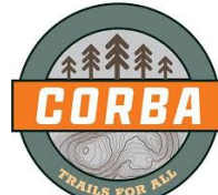
CHIPPEWA OFF ROAD BIKE ASSOCIATION