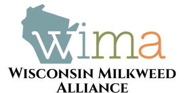
WISCONSIN MILKWEED ALLIANCE